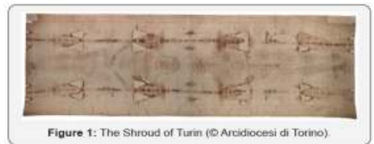
Figure 1: The Shroud of Turin.