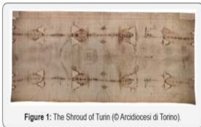
Figure 1: The Shroud of Turin.

Four more readers are needed for the March 29, Good Friday Tenebrae Service at 7:00 pm to read 7 short Gospels. Please call or email Kim Green at the Parish Office if you would like to be included.